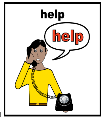
Our Team will help you

You, your family, or support worker can tell us by: